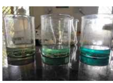
d) Acid leaching process