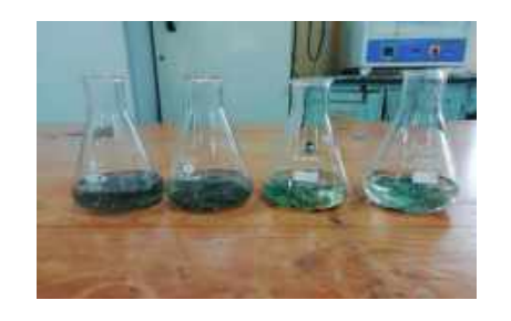
b) Epoxy Removal