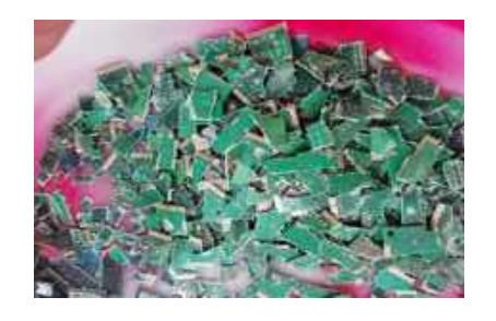
a) Shredded samples