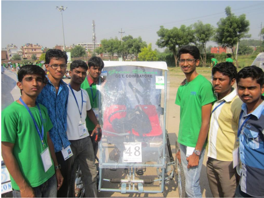
EFFICYCLE 2012 AT CHANDIGARH