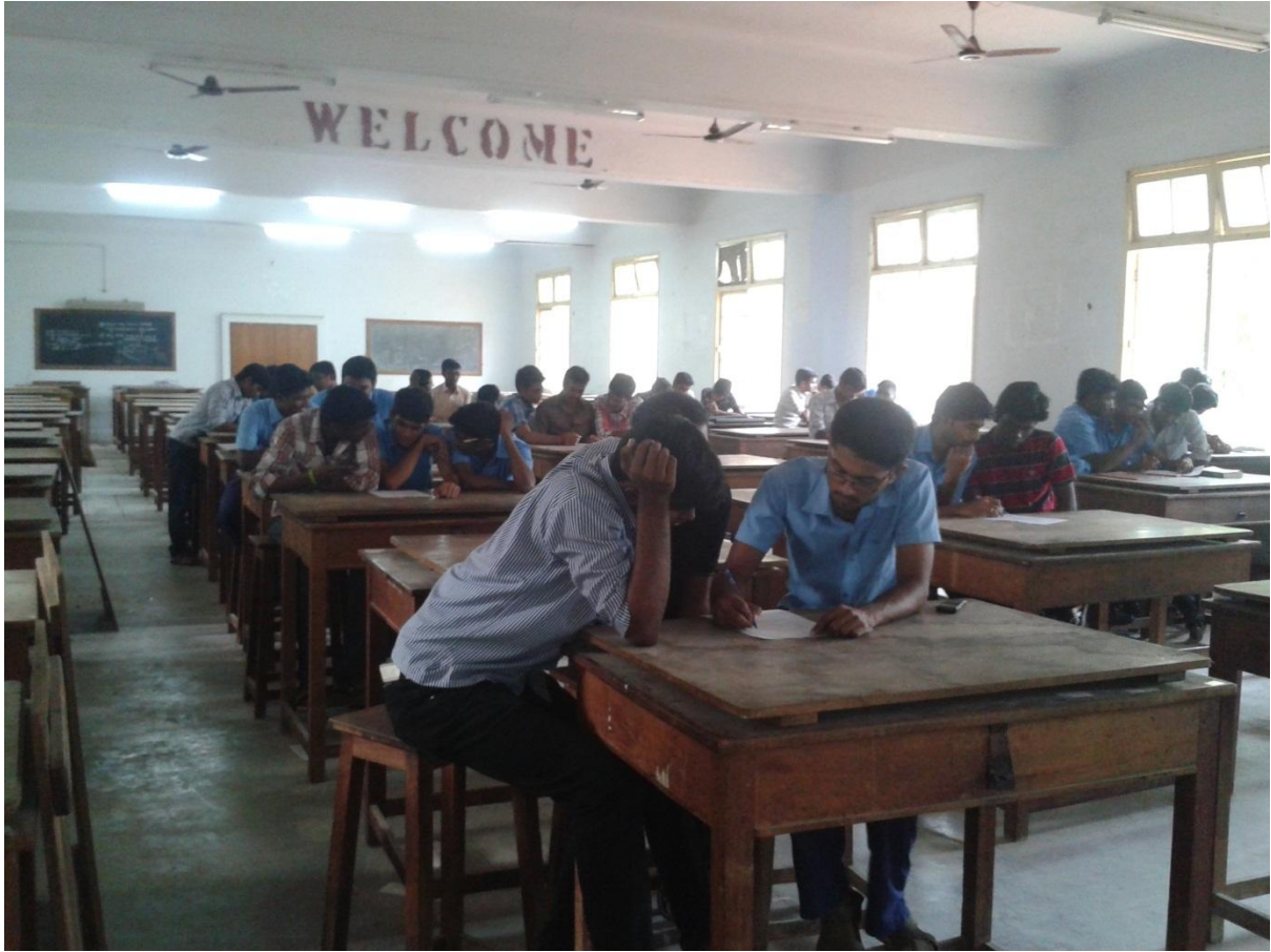
AUTO QUIZ (PRELIMS)